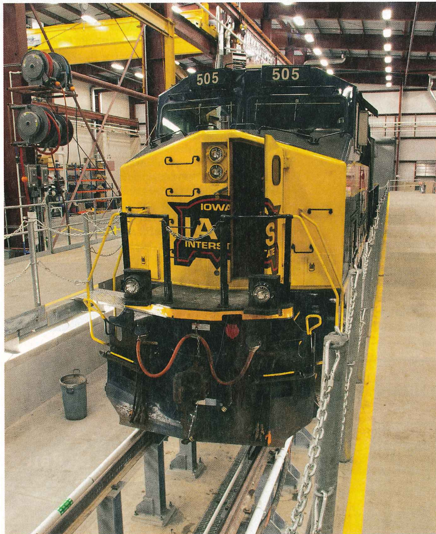
Iowa Interstate ES44AC No. 505 sits on one of two tracks that give the railroad the capability to work on four six-axle locomotives simultaneously.

Shop features enclosed tracks to work on four six-axle locomotives and a separate covered fuel pad