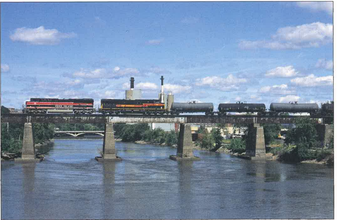
ABOVE: With CRIC in the yard, the BICB crew doubles its train together at Iowa City, making several moves on the Iowa River bridge. RIGHT: "Heritage" unit 513 leads BICB at the U.S. 6 overpass east of Victor, Iowa, a scene documented by multiple railfan cameras.