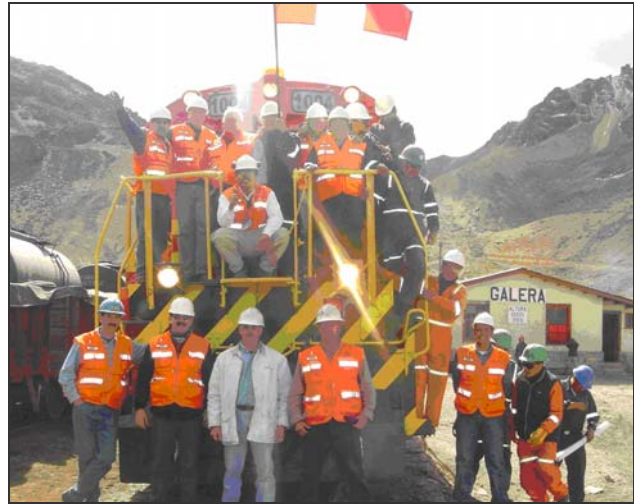
In a trial on June 24, 2005 a seven wagon train was successfully hauled up the 4.7% gradient from San Bartolomé to the line's summit at Galera, 4781m above sea level, demonstrating that the loco could maintain full power on a mixture of diesel and natural gas

Further testing across the FCCA network included measurement of total fuel consumption as well as natural gas consumption per throttle position and radiator water temperature. Gradients and curvature were carefully noted during test runs, as well as weather conditions including temperature and humidity. The success of the trials has led the FCCA board to approve the conversion of its seven-strong GE fleet to dual-fuel operation. This is due to be completed by the end of this year.